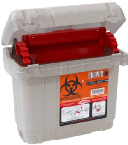
(Horizontal Insert Shown)