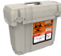
(Vertical Insert Shown)