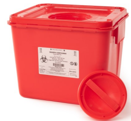
8 Gallon Sharps Container