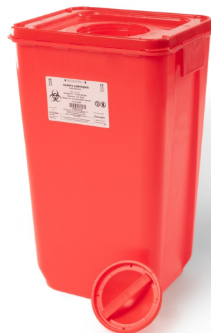
18 Gallon Sharps Container

18 Gallon (15.91 x 13.9 x 25.2) 8 Gallon (15.91 x 13.9 x 12.28)